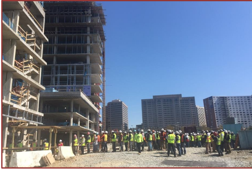
Construction team entering the event