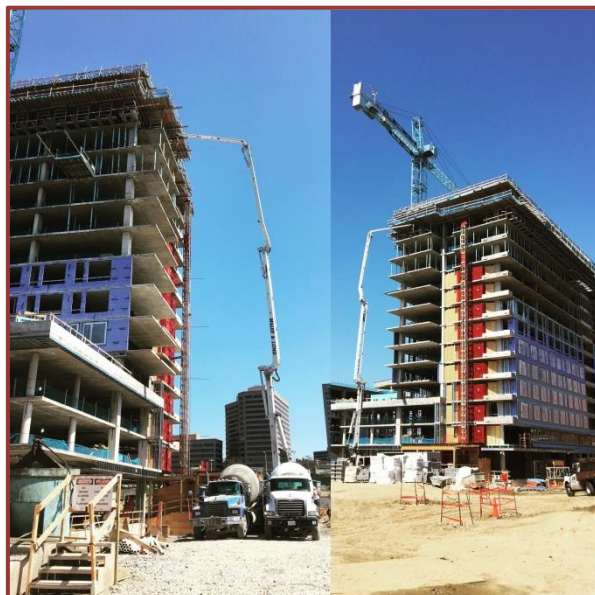
The Pearl (above) Last pour of concrete (right)