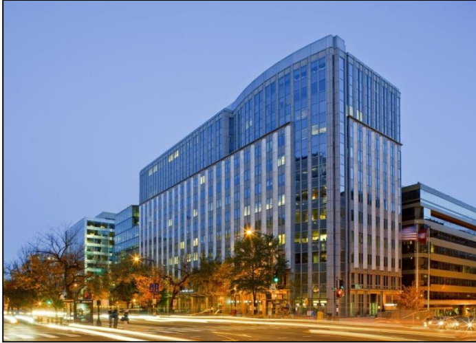
Figure 1: 1909 K Street NW, Washington, D.C. 20006