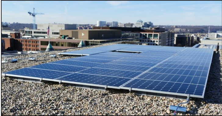
Figure 2: Panels on the penthouse roof of 1909 K Street NW