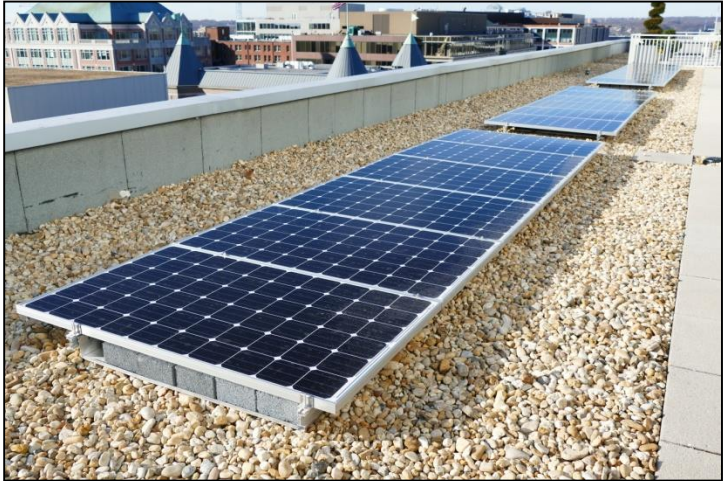
Figure 3: Panels in the terrace roof of 1909 K Street NW